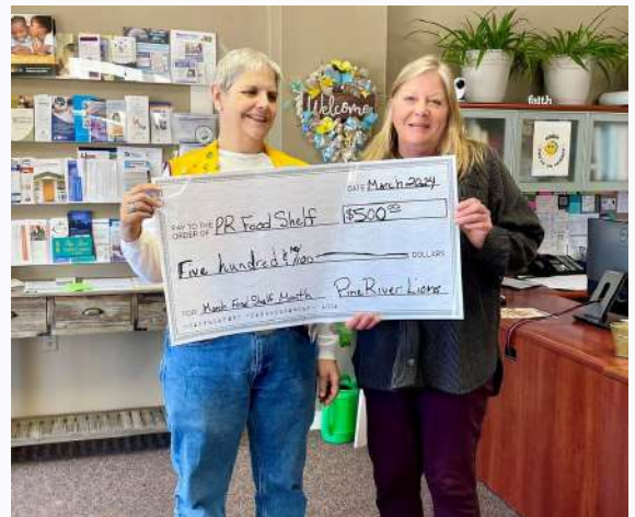
Pine River Lions donated $500 to Pine River Food Shelf for March Food Shelf month, when donations are match.