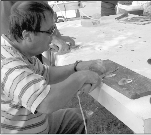
Big or little they all went to the fish cleaners for Wednesday nights fish fry.

programs, Ice Cream Social, Pictures of all the campers and staff, NASA Engineer, Pizzas and Dilly Bars, Smores, Fishing, Fish Cleaning, Fish Fry and Pop, Candy, Chips and Dip N' Dots. We also brought a crew in the week before camp to clean all of the cabins they would be using. Thank you to all of the Lions and friends who donated their time to this great camp.