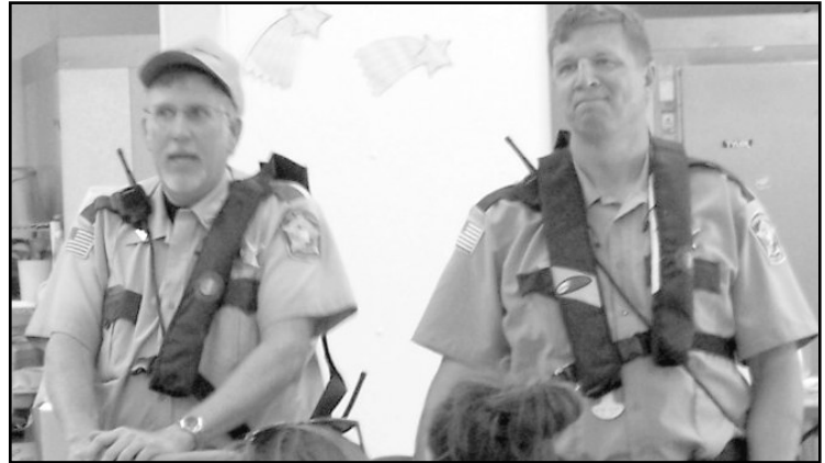
DNR Water Safety Officers from Otter Tail County presented a program to the campers before they headed to the boats for a day of fishing.