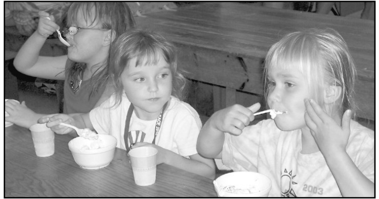
3 young campers enjoy the treats at Kamp KACE's Ice Cream Social Sunday night. Compliments of the Vergas Lions Club.