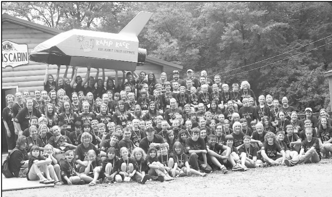
The 2010 “Space Odyssey” Kamp KACE campers.

This year at KAMP KACE could be described as something like a magic show. As fast as things appeared they just as quickly disappeared. On Sunday night 6 gallons of ice cream along with bowls of toppings and sauces disappeared in minutes. Monday night 45 pizzas disappeared as if David Cooperfield was in the room. Tuesday as fast as the boats could get out on the lake, fish started appearing in the boats, but the coolers on the boat packed with beverages and goodies did a disappearing act. Wednesday night the fish that was caught the day before again disappeared in short order. The one thing that remained constant was the smiles and laughter of the 93 participants in this year’s camp.