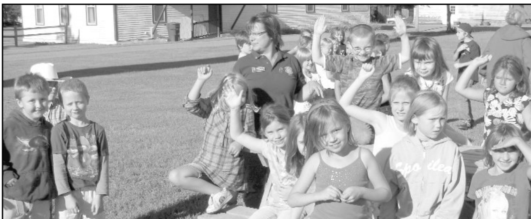
There was many happy faces at the "Back to School Bash" held in Palisade.