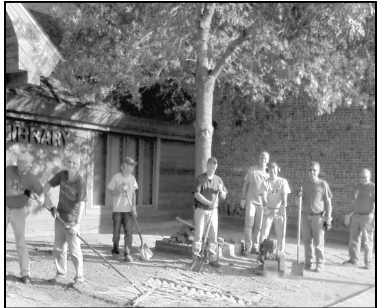
New York Mills Lions Club members worked at leveling off the surface layer of sand before replacing the original bricks outside the city's library.

Friendship Ventures Advocate 612-202-7197