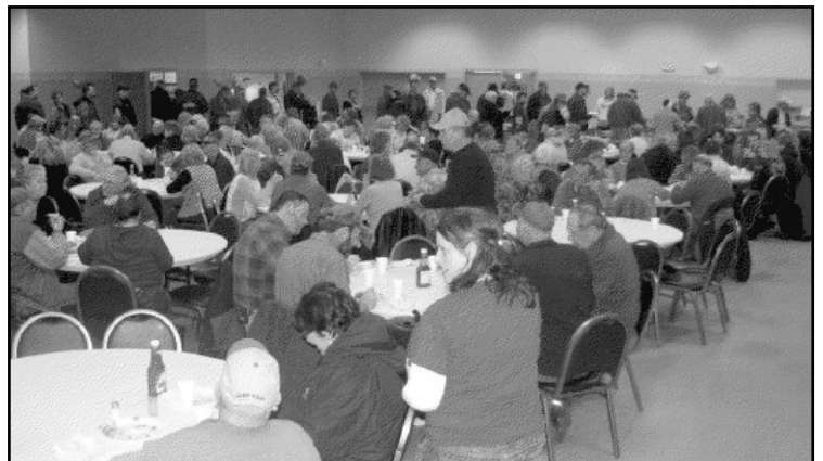
A full house at the Parkers Prairie Annual Smelt Fry. You had to wait in line, but the meal was worth the wait.