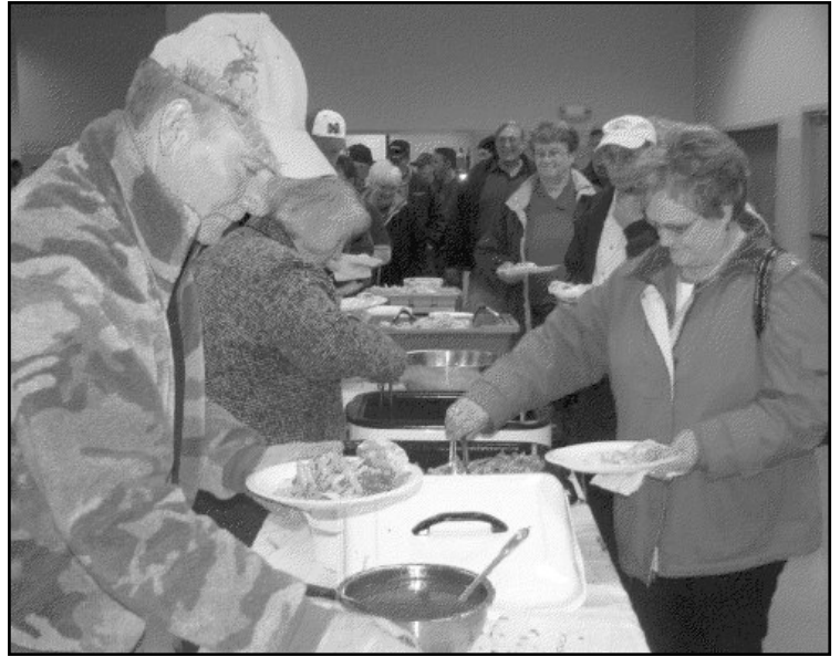
All smiles as everyone takes a plate of fresh smelt and all the trimmings at the Parkers Prairie Annual Smelt Fry.