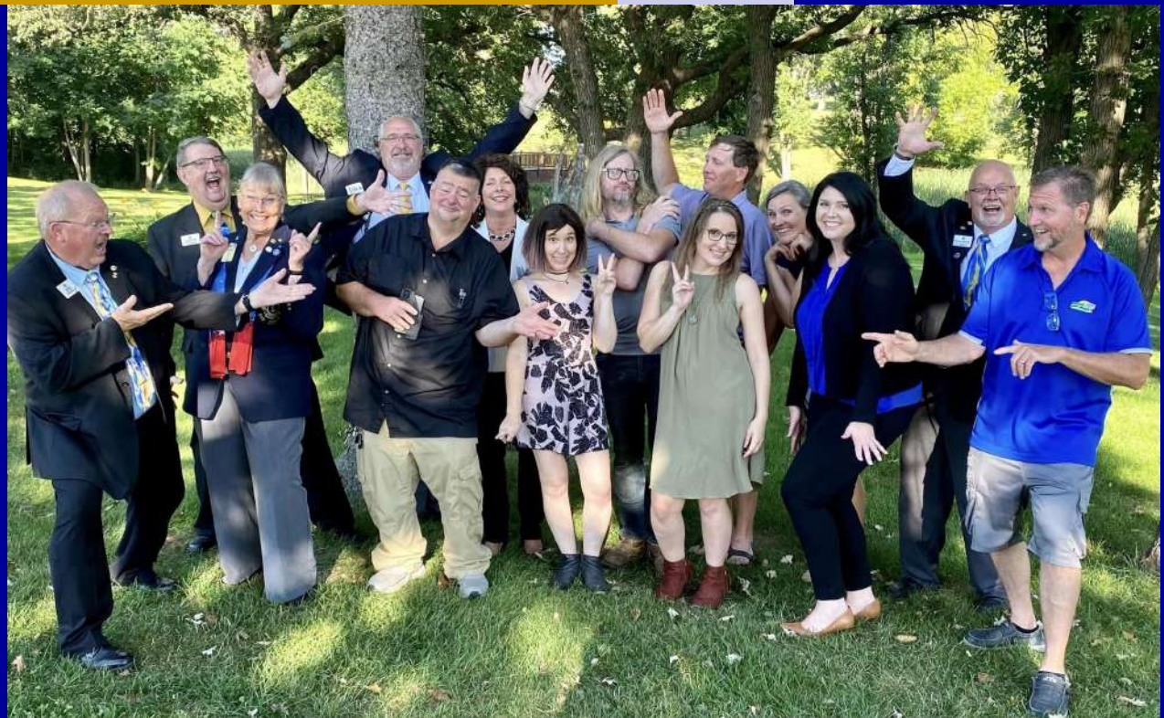
yes, we had their first Action Pic! ...