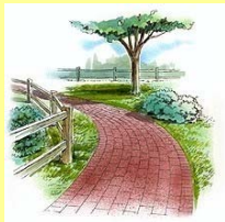
Walking the Pathway of Service