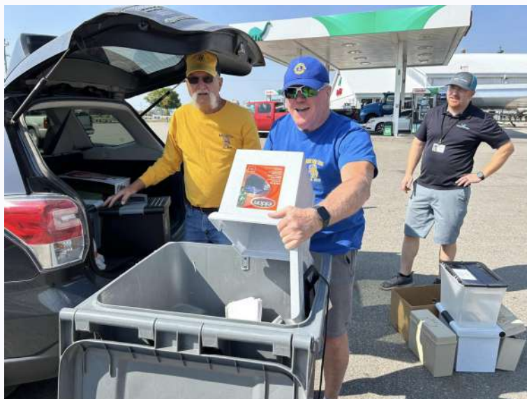
Battle Lake Lions had a beautiful day for their paper shredding event!