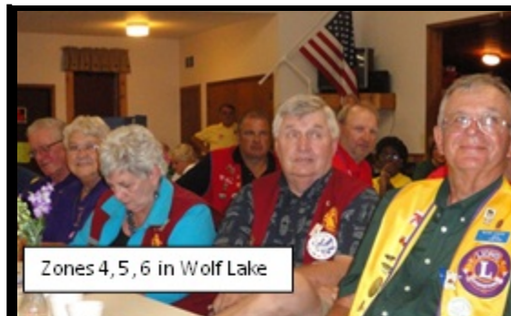
Zones 4, 5, 6 in Wolf Lake