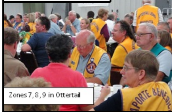
Zones 7, 8, 9 in Ottertail