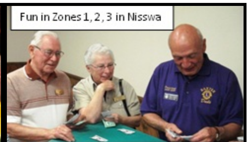
Fun in Zones 1, 2, 3 in Nisswa