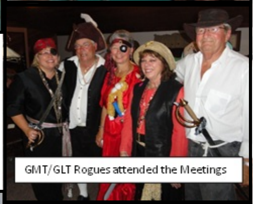
GMT/GLT Rogues attended the Meetings