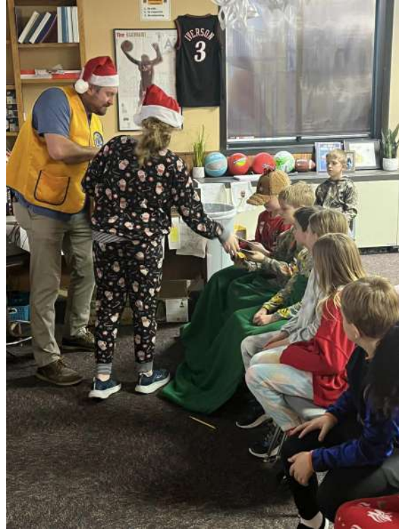
Spreading holiday joy to the kids at Nevis School