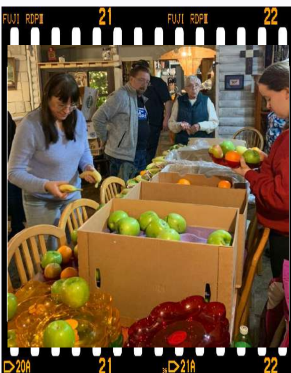
Merrifield Lions busy assembling fruit baskets for the elderly, needy, and some helpful neighbors.