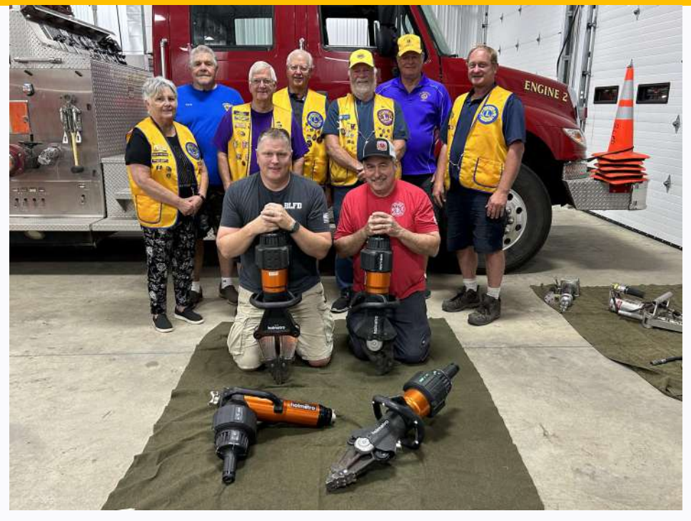
Zone 8 Lions donate to Battle Lake Area Fire Department

During a crucial accident call, the Battle Lake Area Fire Department, found that their extrication equipment, or "Jaws of Life" worked but due to the cold weather and severity of the damage to the vehicle, the equipment had issues. Since the fire department budget could not stretch to cover the $50,000 cost of a new "Jaws of Life", Zone 8 Lions Clubs stepped up to donate enough funds to replace the old "Jaws of Life" with a new Holmatro unit. The new unit has 4 parts and all with a battery charger: a cutter, spreader, telescoping ram and combination tool.