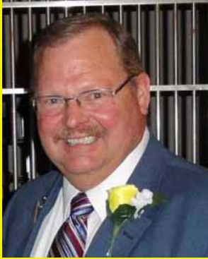
DG Bruce's Port of Calls & Club Visits